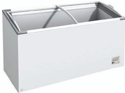
G-F298 OCG / G-F398 OCG / G-F498 OCG / G-F598 OCG