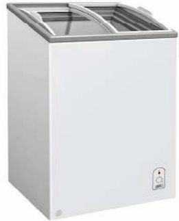
G-F98 OCG / G-F148 OCG / G-F198 OCG